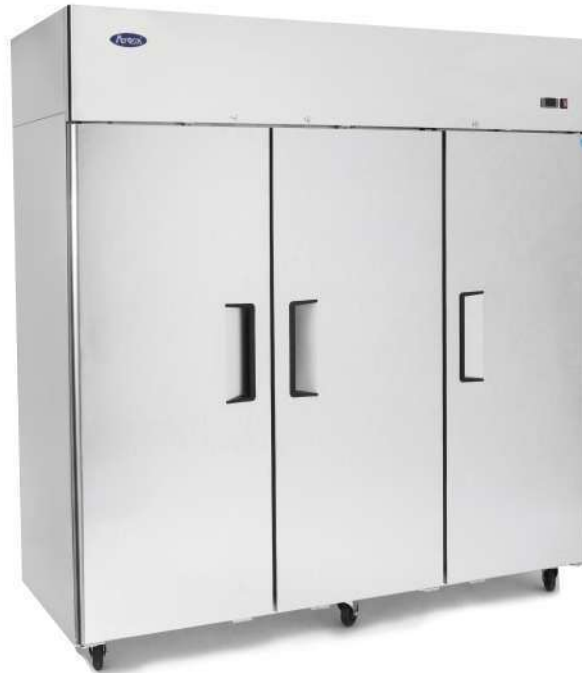
Top Mounted Three Door Refrigerator / Freezer